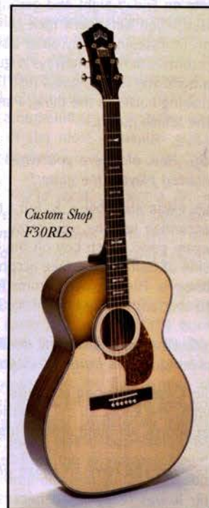
Custom Shop F30RLS