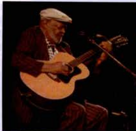
Robert Junior Lockwood